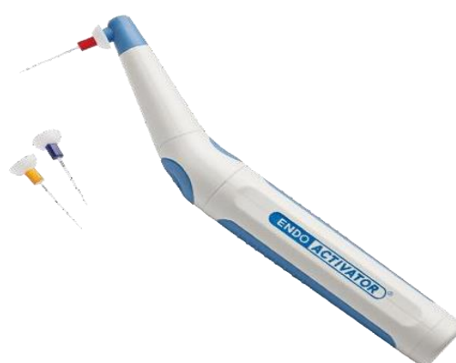
Fig. 3. EndoActivator®