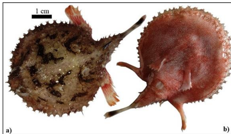
Fig. 2(a). Dorsal side (b) Ventral side of H. indica

width of the disk are nearly equal. The dorsal surface is covered with numerous strong, sub-equal spines, many of which are bifid, and at the edge, many are trifid. Most of the spines have four roots, projecting freely at the edge of the disk and accompanied by delicate cuticular processes. The anterior extremity of the roof of the tentacular cavity reaches or slightly advances beyond the anterior extremity of the disk, with the cavity's aperture being vertical and concealed from above. The strong spine on each side of the cavity projects beyond the margin of the disk. Additionally, the superciliary ridge is equipped with strong spines, and the ventral surface is covered with minute, scattered spines.