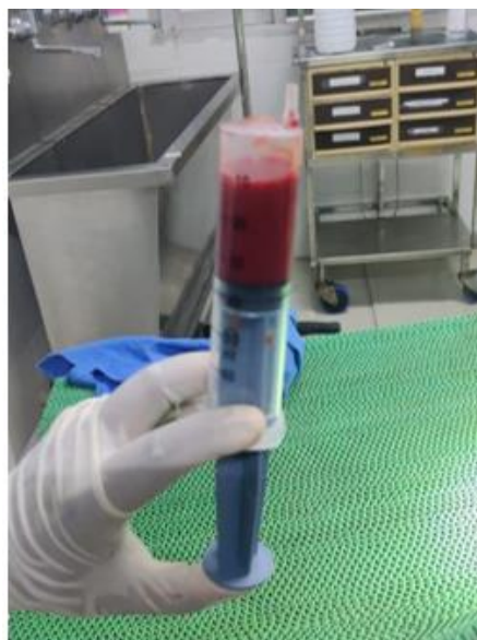
Plate 4. Blood retrieved through chest tube