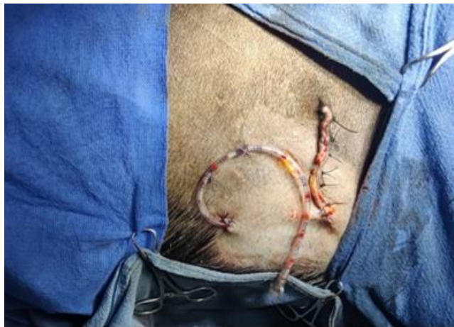
Plate 3. Chest tube placement