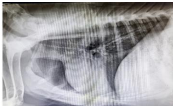
Plate 6. 1.5 months post-operative radiograph

Post-operatively, the animal was kept on inj. Dicrysticine @ 5 mg/kg b.wt i/m b.i.d. for five days and inj. Melonex @ 0.2 mg/kg b.wt i/m o.i.d for three days. Through the chest tube around 15 ml blood was retrieved immediately after surgery (Plate 4). The chest tube was left in situ for next 3 days till no retrieval of blood from the thoracic cavity. The skin sutures were removed on the 14 th day post-operation. The animal recovered successfully with no complication (Plate 5). After 1.5 months' post-surgery the radiograph revealed no signs of haemothorax (Plate 6).