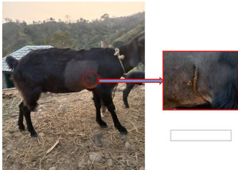
Plate 5. 14th day post-operatively