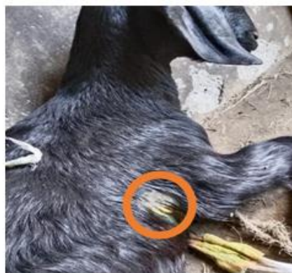
Plate 1. Location of the punctured thoracic wound

examined after clipping the hairs around the wound it was found that the thoracic muscles are completely torn at the level of the wound and the air is coming out from the punctured wound during the expiration. So, an immediate decision was taken to surgically repair the open thoracic wound. The heart rate and rectal temperature was in the normal physiological range. Although the respiratory rate was slightly depressed and the heart sounds are diminished in the auscultation.