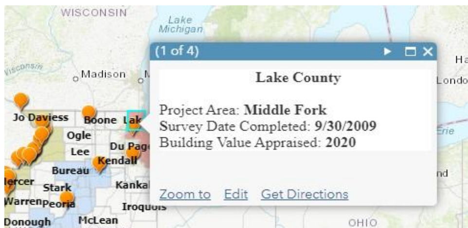
Fig. 3. Pop-up details for County in Flood Prone Zone