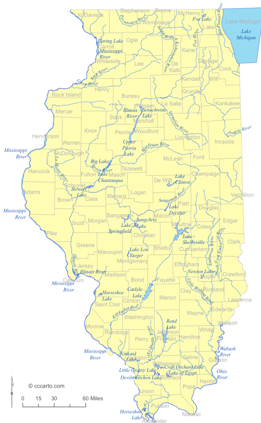
Fig. 1. Illinois Watershed map (CCCarto.com, 2024)

This research focuses on the significance of applying GIS software in Illinois for flood mitigation. As the most frequent natural disaster in the state, accounting for the major destruction to lives and properties, effective flood management increasingly relies on predictive tools and GIS mapping. GIS helps identify flood-